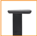
TH - $187

T-style, super duty arm, gel comfort pad