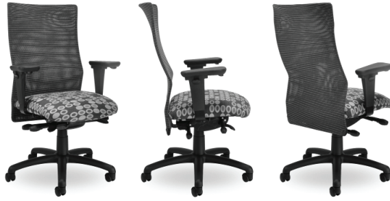
pictured model JA210 Q25 TE ASD BAA