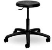
pictured model IN06 E20