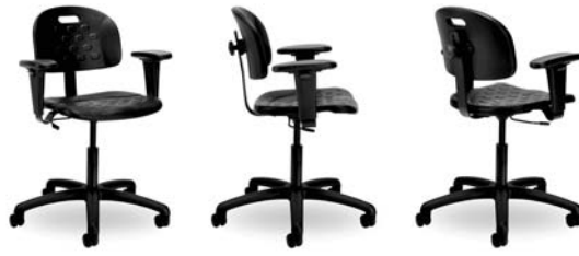
pictured model IN212 M20TL