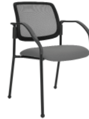
pictured model Mesh Back EN244