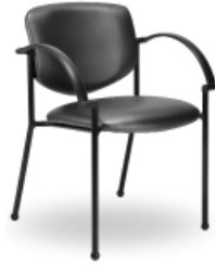
pictured model Upholstered Back ES244

EN244/EN243 SIN#: 711-18 ES244/ES243 SIN#: 711-19