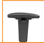
T4 - $141