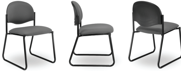
pictured model AD233